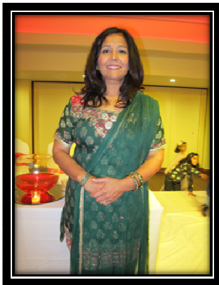
AMA : Eid Ul ADha Dinner. Chief Guest: Yasmin Qureshi

Don't forget the 'Old Spectacle Collection'. Cases are not needed, but wrap the glasses so they don't get scratched and place them in the box at the centre.