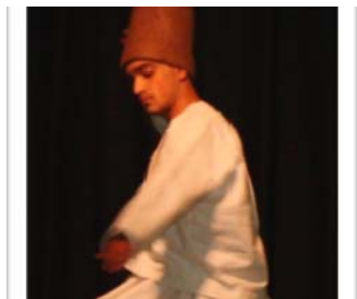
Altrincham Interfaith Group— Evening of Entertainment.