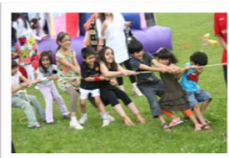
Some pictures of the AMA Fun day 2009.