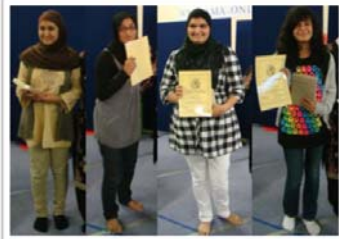
GCSE Students receiving their awards.